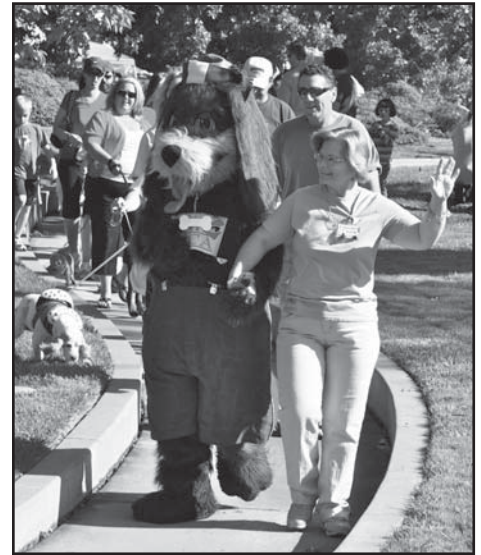
Muttley, along with all the other canines and their human companions, enjoyed the parade around the beautiful campus of Telefunken Semiconductors.

We would like to give a special thanks to our event hosts. Mercedes-Benz of Rocklin hosted Barks, Brats & Bids on Saturday, October 1 and Telefunken Semiconductors invited us to return for the Barktoberfest Family Festival on Sunday, October 2. The beautiful 80 acres of the Telefunken campus created a perfect setting for the one-mile Doggie Parade that kicked off the day, as well as space for 65 vendors and many activities throughout the day.