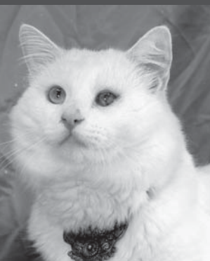
Kodiak had to have an eye removed due to a tumor. His care cost $185.41.

Placer SPCA in Auburn (530) 823-7722 placerspca.org/auburn