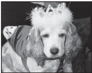
Queen Boo set a new record for the Barktoberfest King & Queen contest, raising over $800.

Barktoberfest would not be possible without the support of our sponsors, purveyors, vendors and other participants. Thank you! Please visit www.placerspca.org/barktoberfest for a slideshow of event photographs and a full listing of all our event supporters.