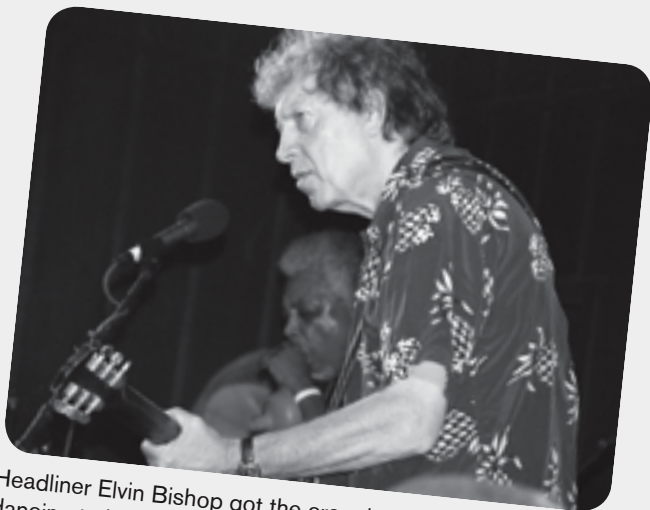
Headliner Elvin Bishop got the crowd on their feet and dancing to his hit, Foiled Around and Fell In Love .